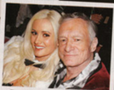
Those wedding rumors? "Not now. Maybe next year!" says Madison (with Hefner in 2005).

Now I'm really happy. I don't have to stuff my bra, and I feel more comfortable naked. And my nose, which had a bump, is now shorter and upturned. It makes a huge difference in pictures. I wouldn't get anything else done right now. Maybe when I'm 60, but I don't want to go back under the knife anytime soon!