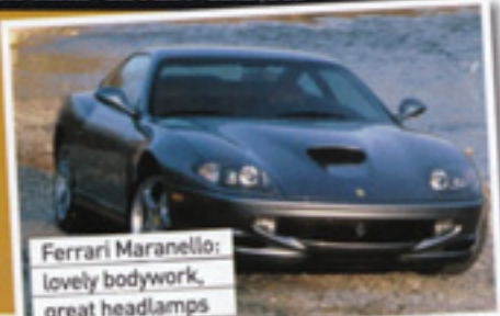
Ferrari Maranello: lovely bodywork, great headlamps